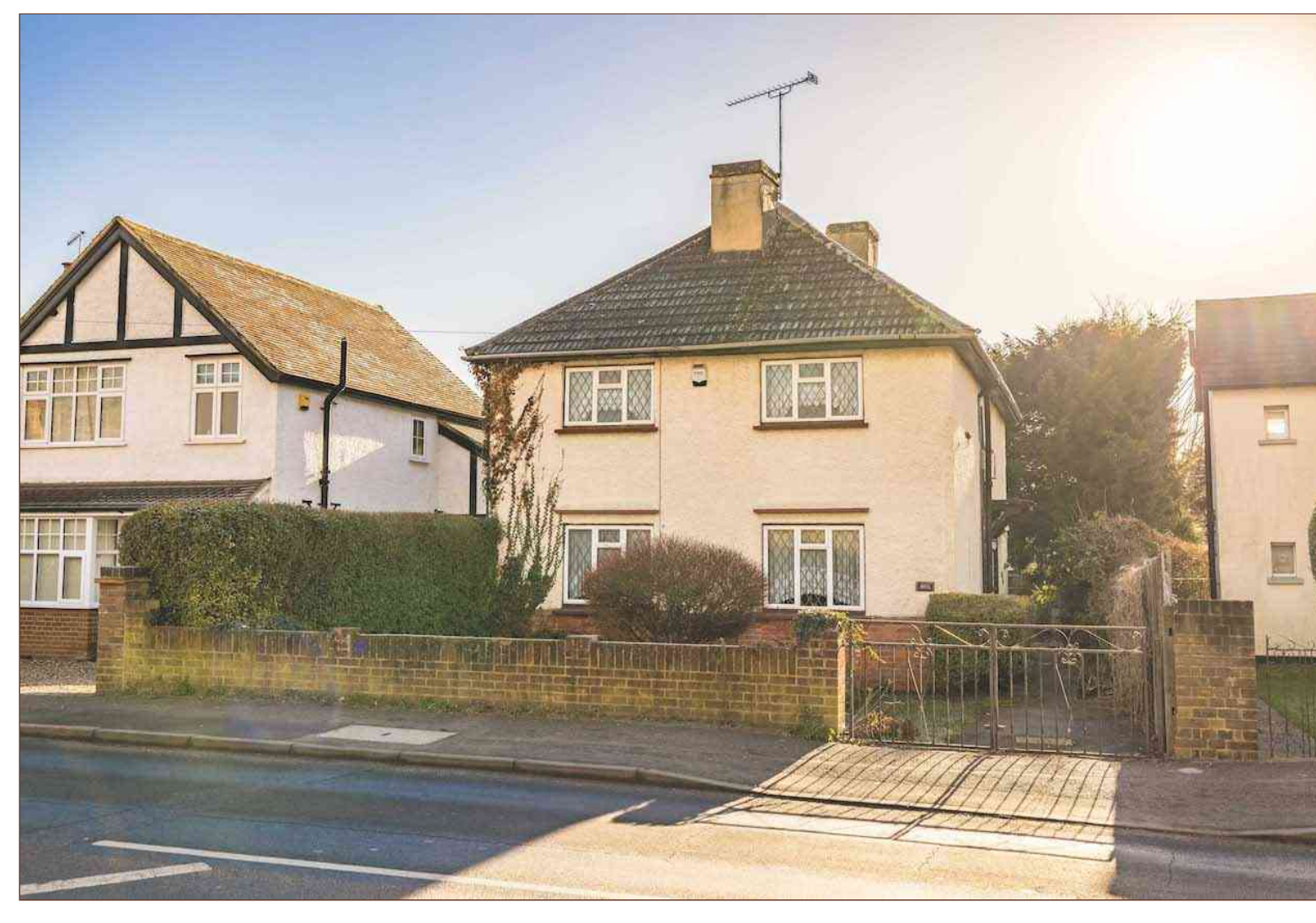
This four bedroom detached house is situated on a generous plot within a short walk of Taplow Rail Station (Queen Elizabeth Line) and local amenities. The property was built in the 1920s and is offered to the market in need of modernisation and with the potential to extend onto the side/rear (STP).