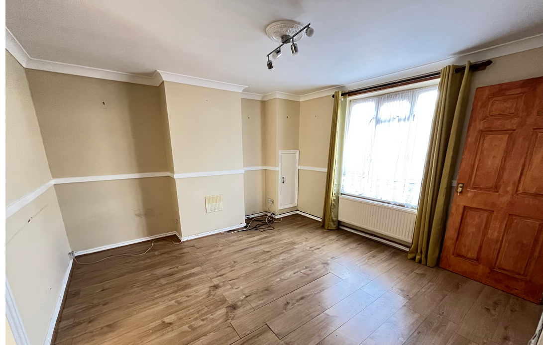
55 Spelthorne Lane, Ashford, Surrey TW15 1UN £380,000 - Freehold