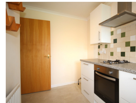
10 The Mews, Norton Road, Letchworth Garden City, Hertfordshire, SG6 1AL