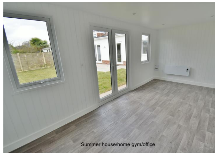
Summer house/home gym/office