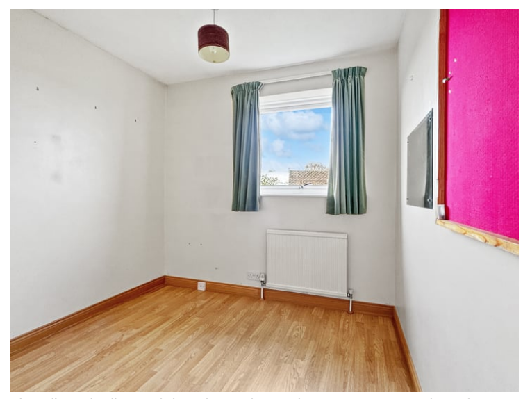
8' 10" x 8' 5" Double glazed window to rear and radiator.