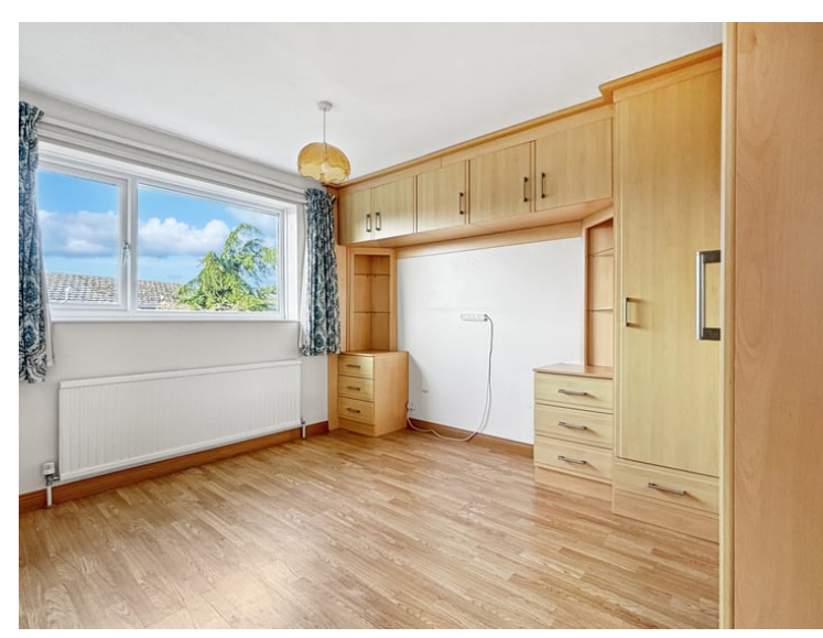
12' 4" x 9' 9" (3.76m x 2.97m) Double glazed window to front, radiator and fitted wardrobe.