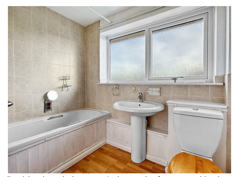
Double glazed obscure window to the front, panel bath, wash basin, WC, and radiator.