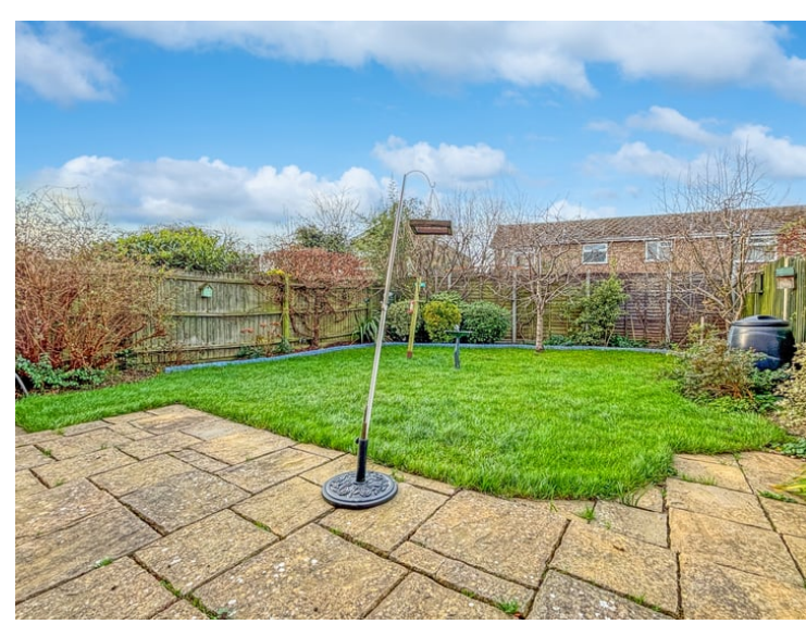
A well maintained rear garden mainly laid to lawn with patio area, well stocked with mature shrubs and retained by fencing.