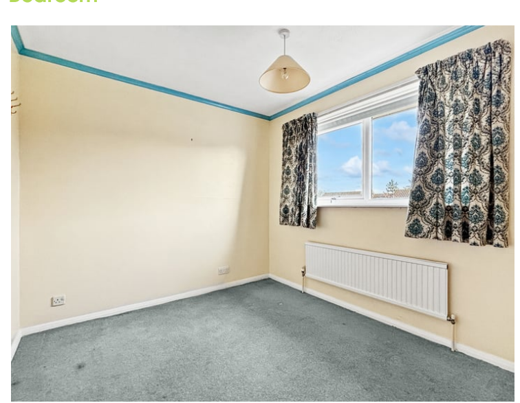
9' 9" \times 9' 0" (2.97m \times 2.74m) Double glazed window to rear, radiator and fitted wardrobe.