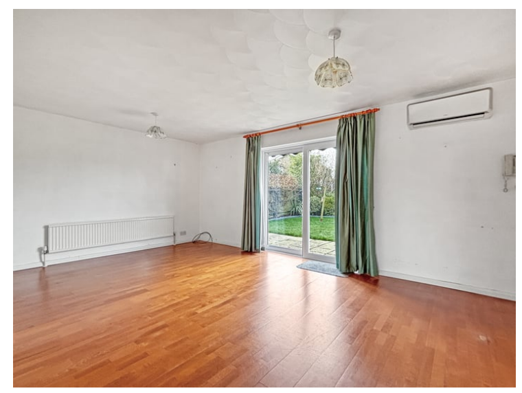
18' 5" x 11' 5"

Double glazed patio door to rear, two radiators and air conditioning unit.