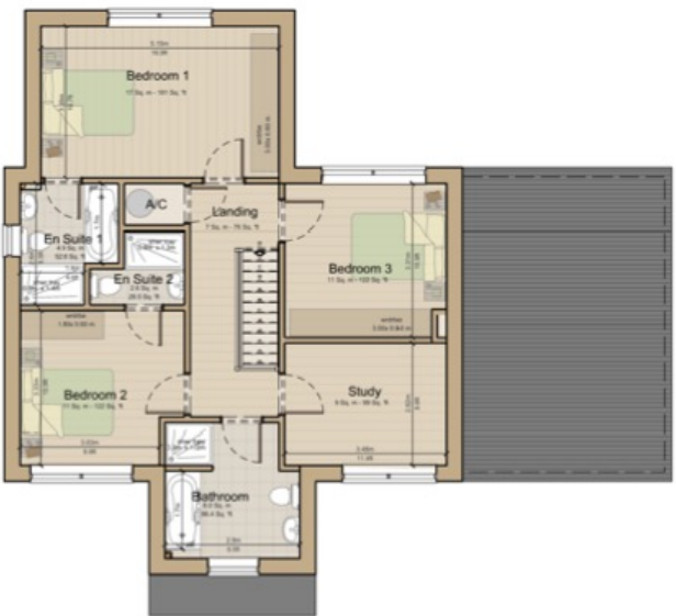
FIRST FLOOR PLAN GIA FLOOR AREA - 79 Sq. m - 849 Sq. ft

A FULL VIRTUAL TOUR IS AVAILABLE OF THE SITE VIA OUR WEBSITE AND ON OUR YOUTUBE CHANNEL