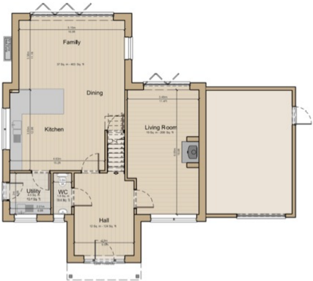
GROUND FLOOR PLAN GIA FLOOR AREA - 79 Sq. m - 849 Sq. ft