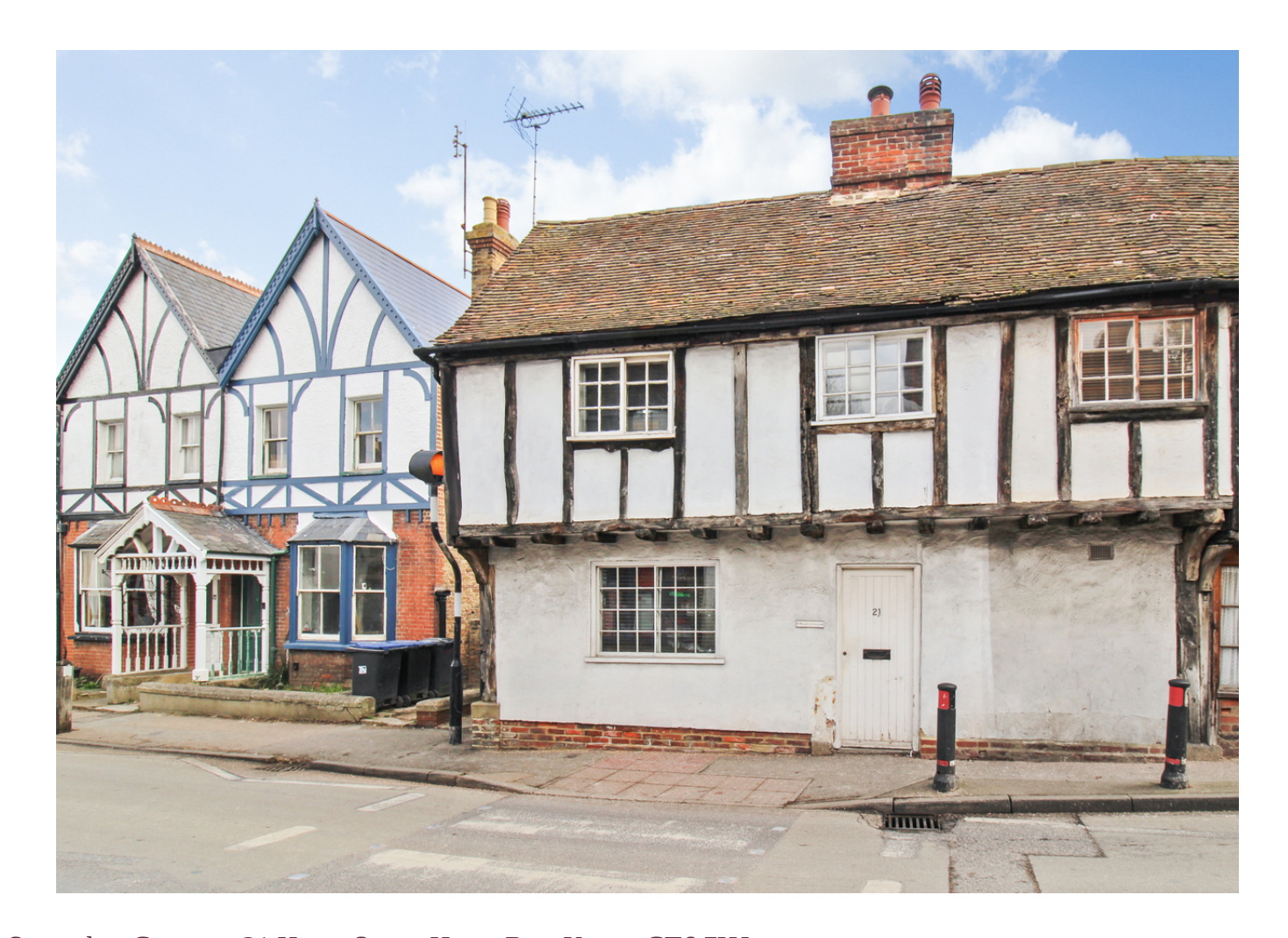
1 Smugglers Cottages, 21 Herne Street, Herne Bay, Kent, CT6 7HJ