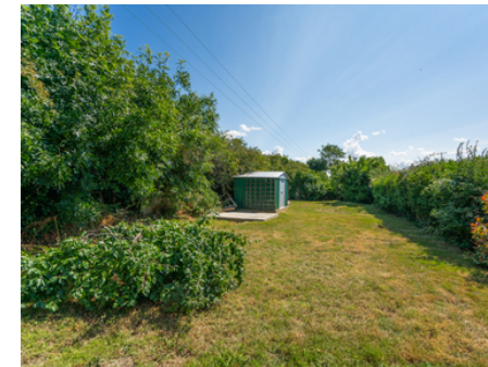
26 Windsor Way, Langford, Bedfordshire, SG18 9PB