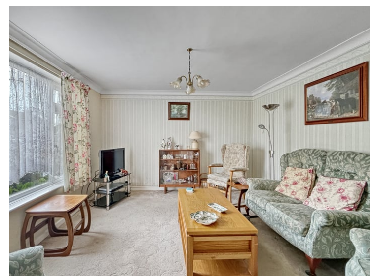
13' 7" \times 11' 0" (4.14m \times 3.35m) Double glazed window to front and radiator.