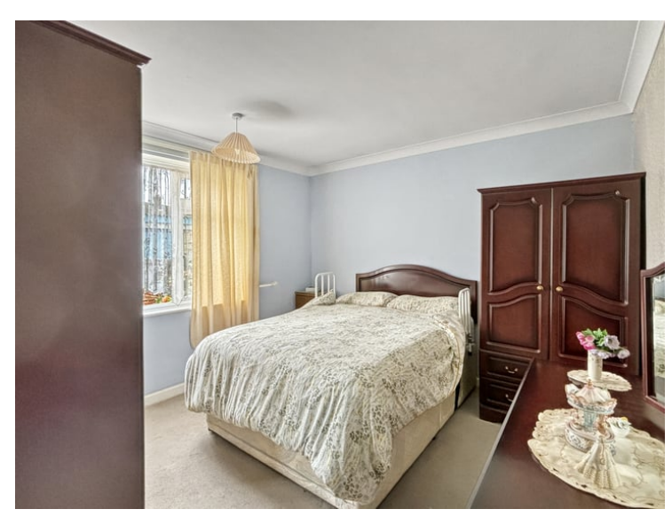
12' 5" x 11' 02" (3.78m x 3.40m) Double glazed window to rear and radiator.