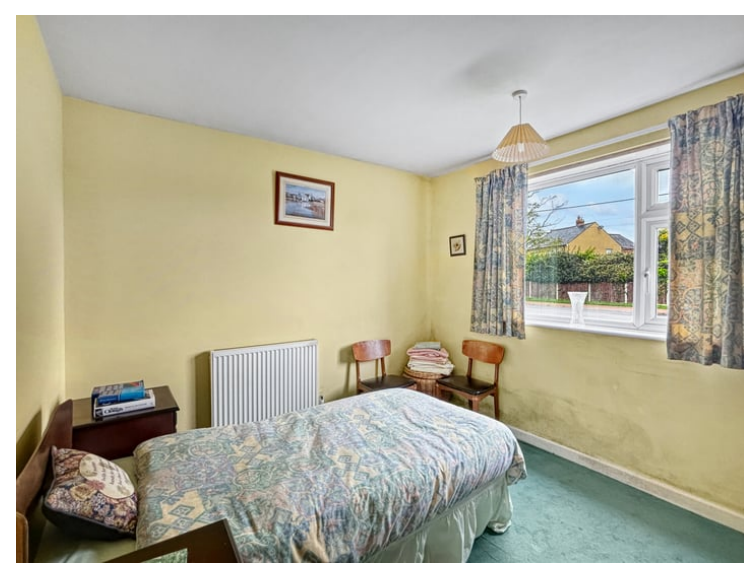
10' 2" x 9' 5" (3.10m x 2.87m) Double glazed window to front, radiator and storage cupboard.