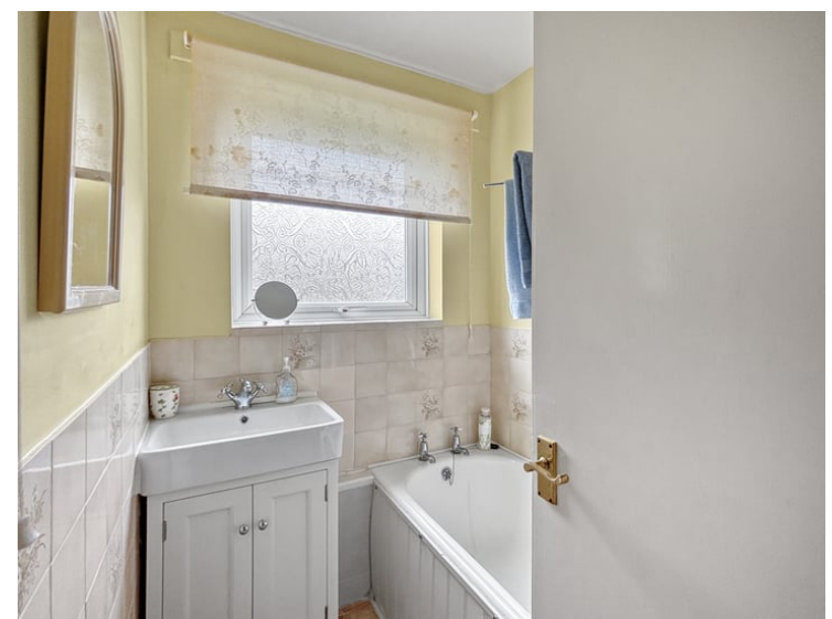
Double glazed window to rear, radiator, part tiled walls and panelled bath.