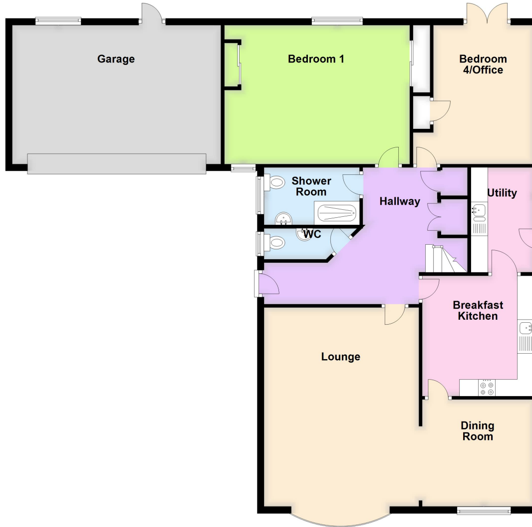
Ground Floor Approx. 145.3 sq. metres (1563.8 sq. feet)