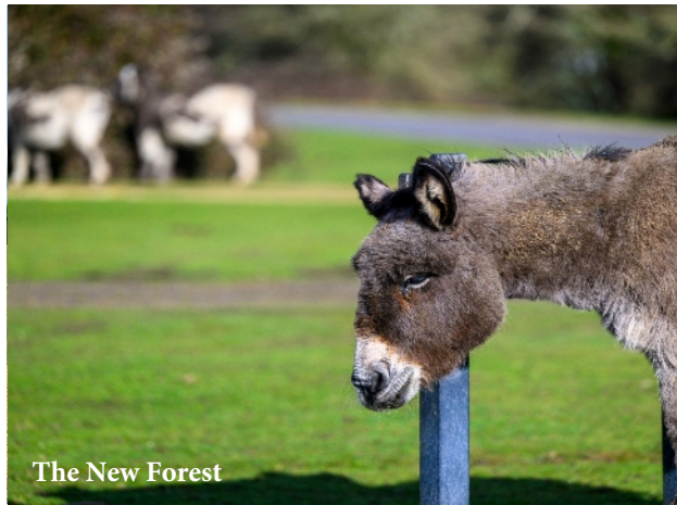
The New Forest