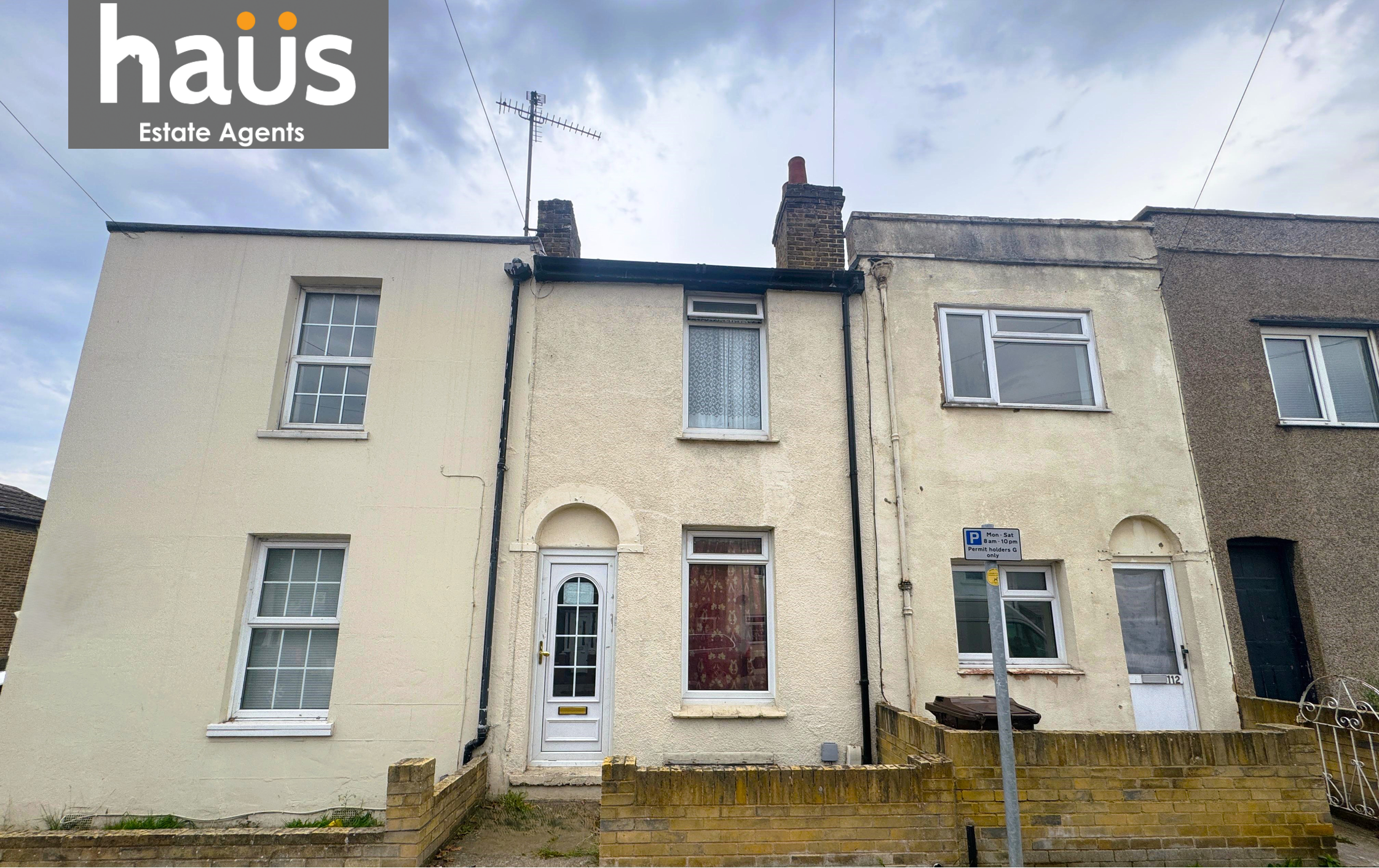
Two Bedroom Terraced House Saunders Street, Gillingham, Kent, ME7 1HX