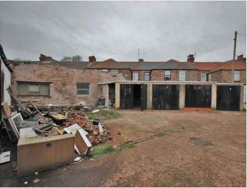
Workshop Twelve Lock-up Garages