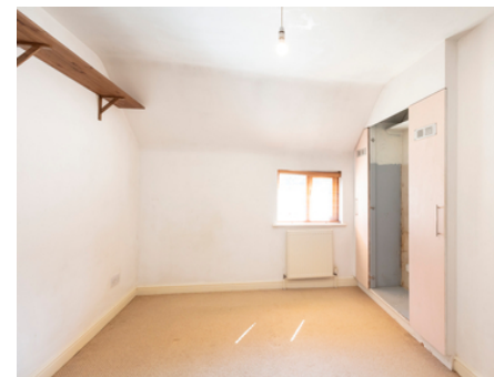
6 The Fields, Langford, Bedfordshire, SG18 9QX