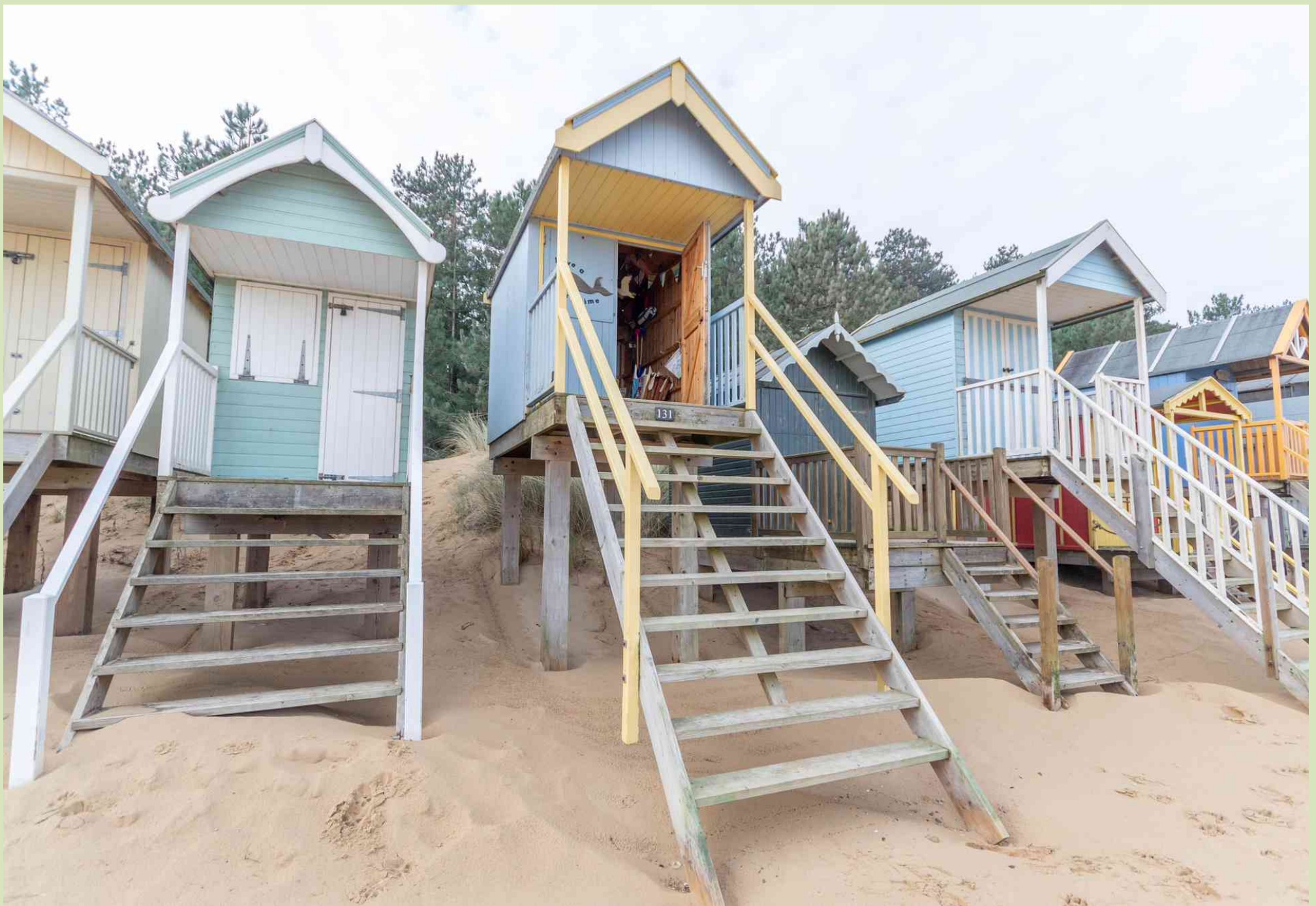
Beach Hut 131, Wells next the Sea Guide Price £85,000