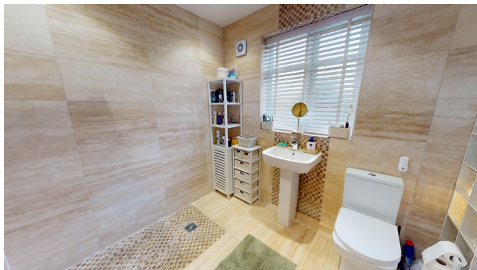
Master Bedroom with En Suite