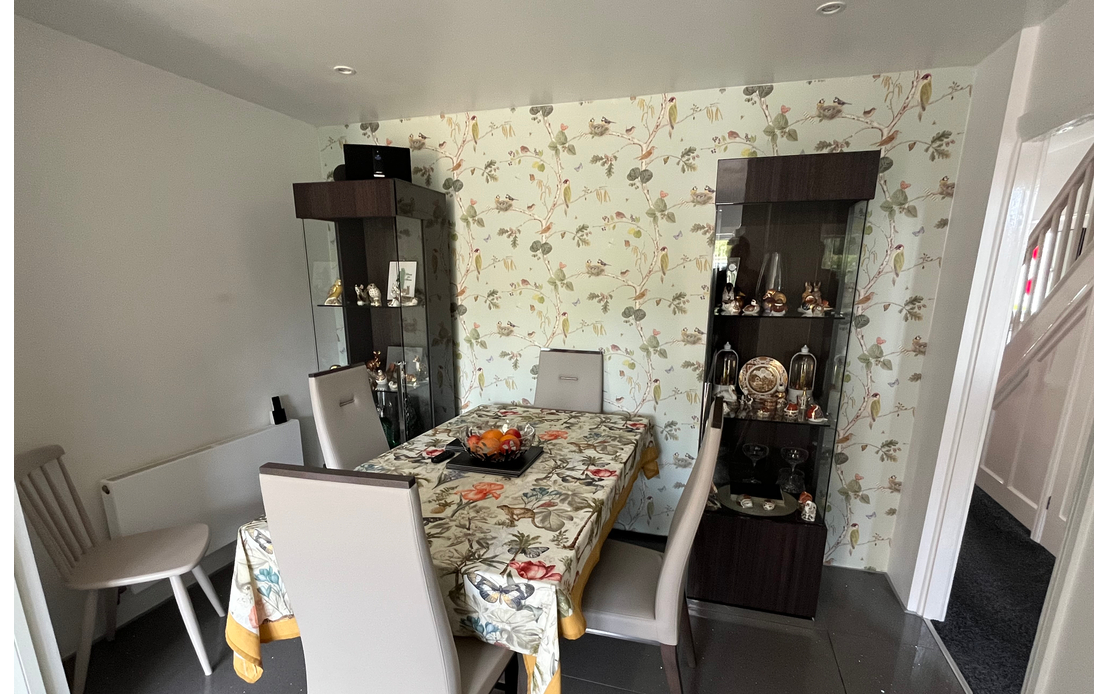
72 Evelyn Crescent, Sunbury-on-Thames, Surrey TW16 6LZ £525,000 - Freehold