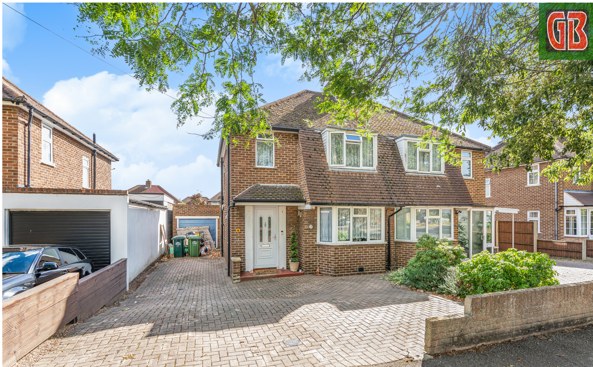
37 Worple Road, Staines-upon-Thames, Surrey. TW18 1LQ. 3 Bedroom Semi-Detached House - £500,000 OIEO Freehold