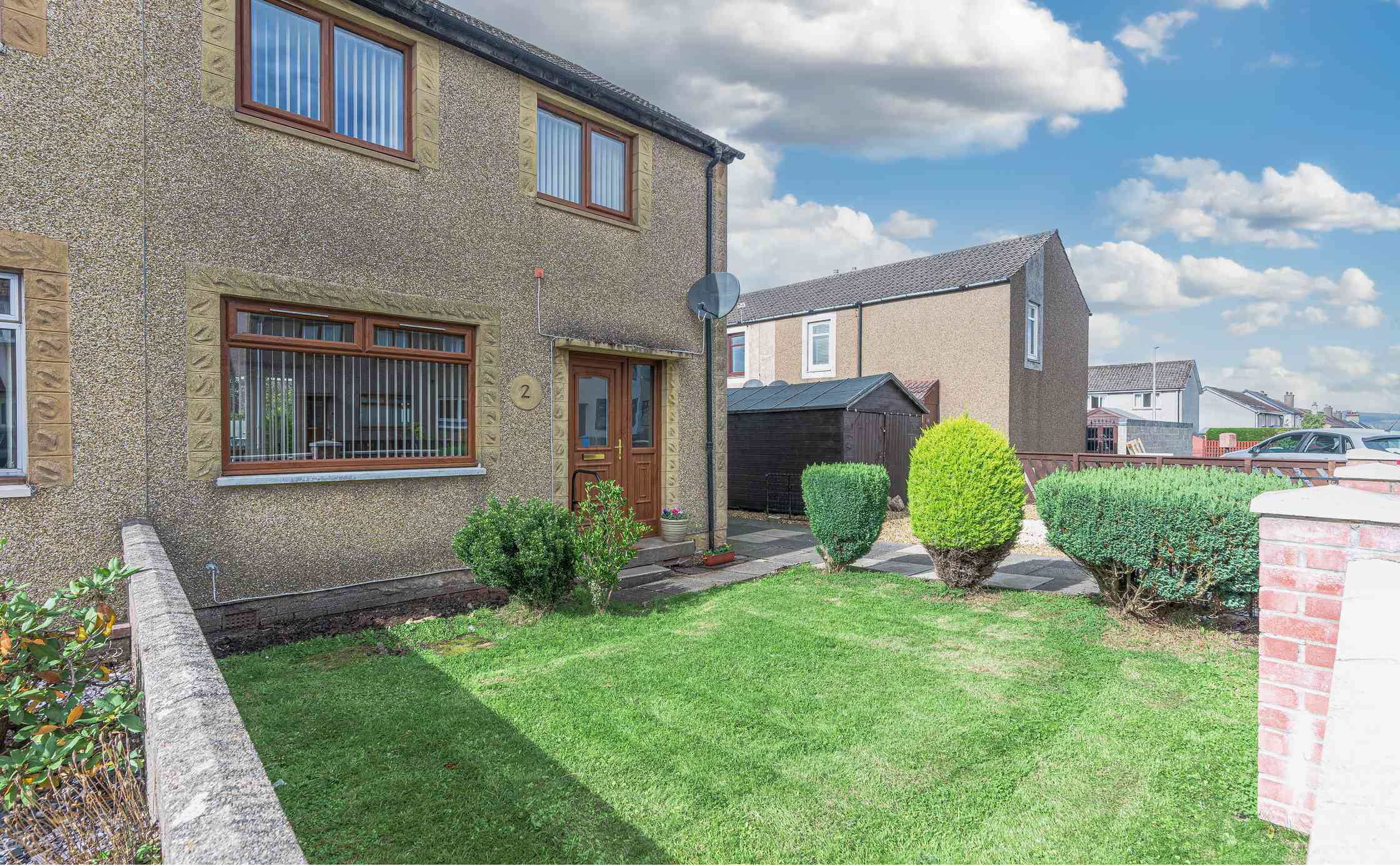
Offers Over £124,500 2 Watters Crescent, Lochgelly, Fife, KY5 9LD