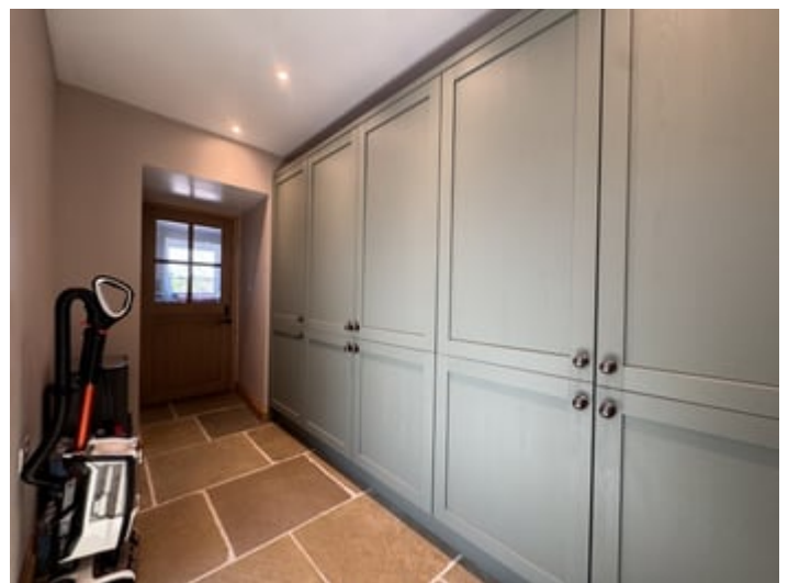
With a range of fitted cupboard space.