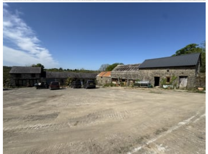
Provides as follows -