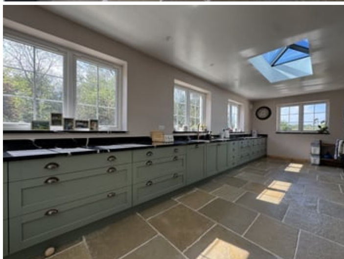
Extended Kitchen Area