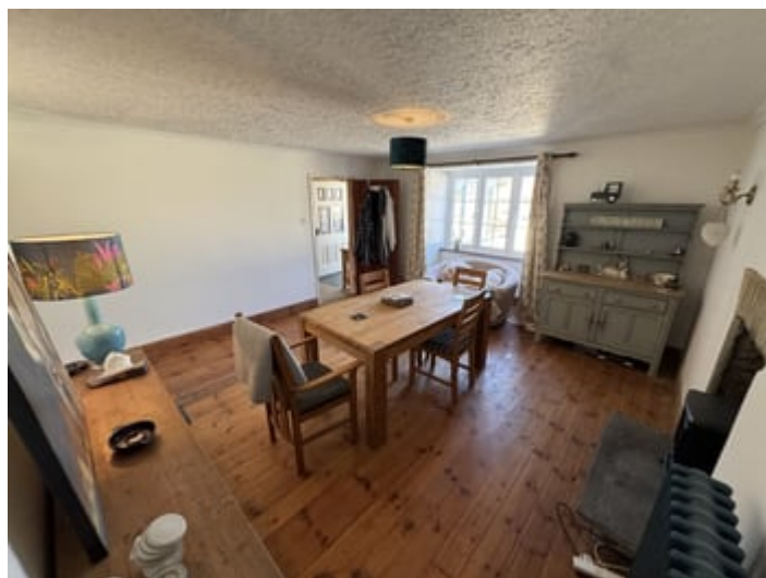
Study Area / Music Room