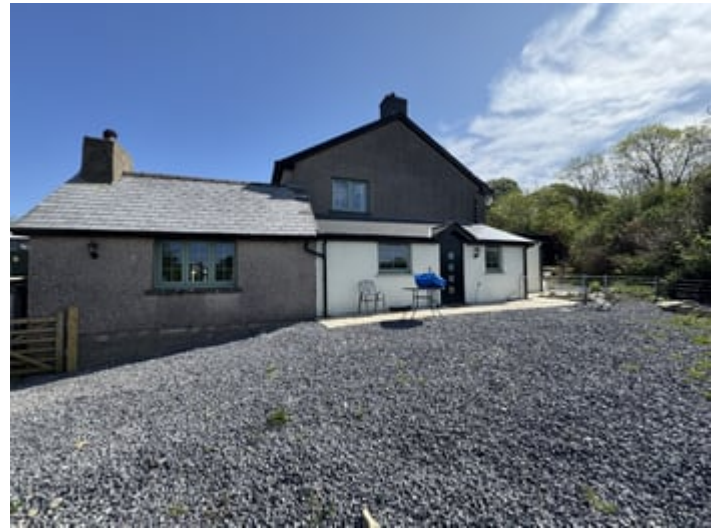
Range of Stone outbuildings