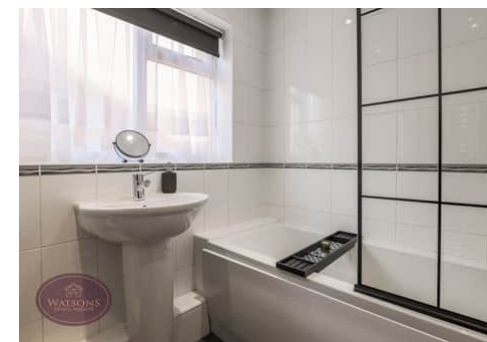
• Extended Detached Family Home