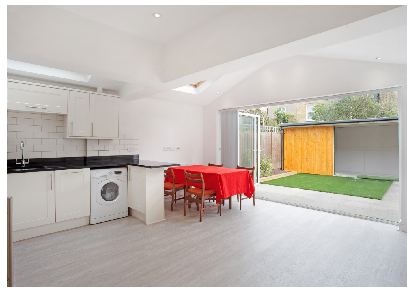
2 BEDROOM FLAT