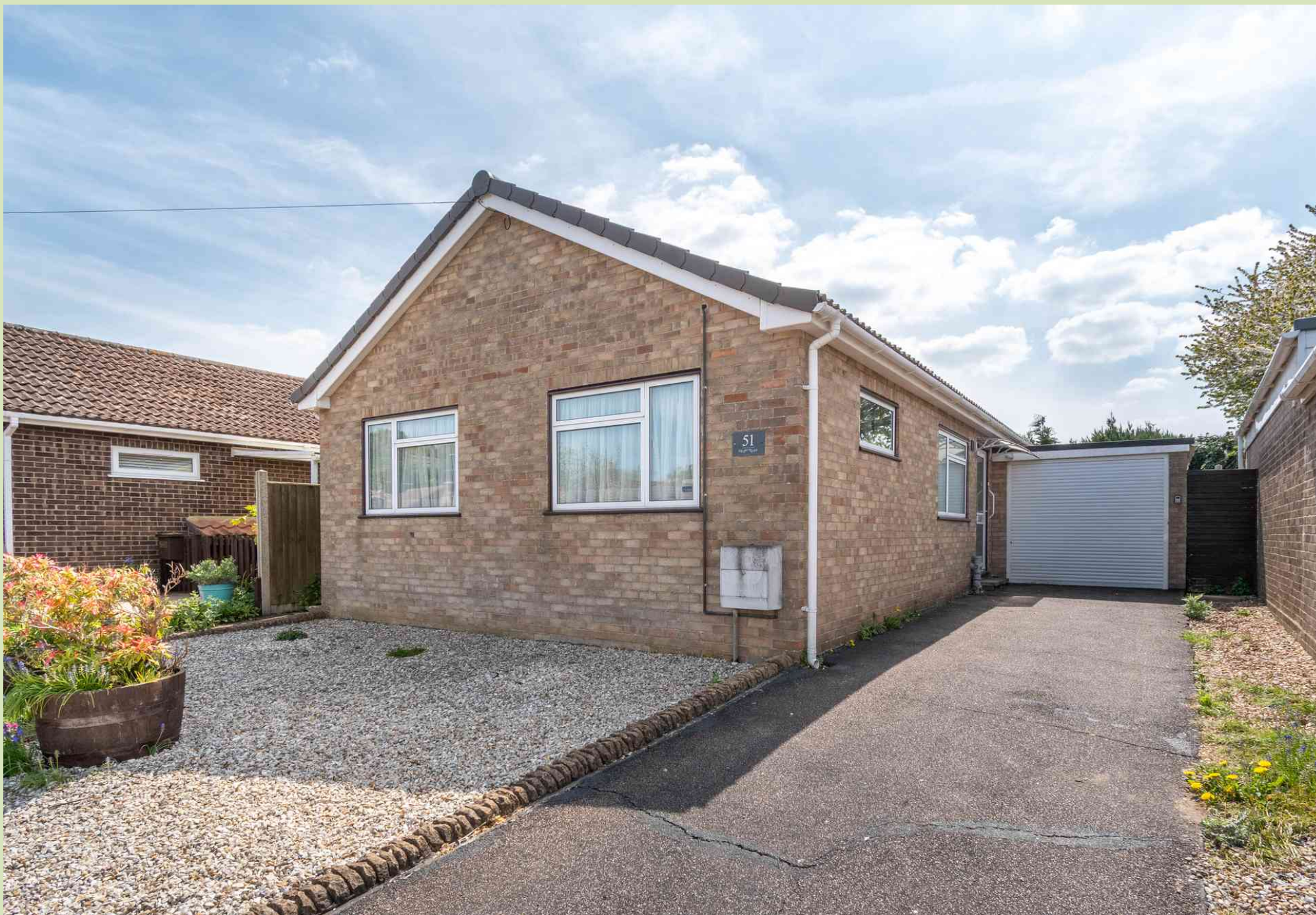
51 Waveney Close, Wells-next-the-Sea Guide Price £425,000