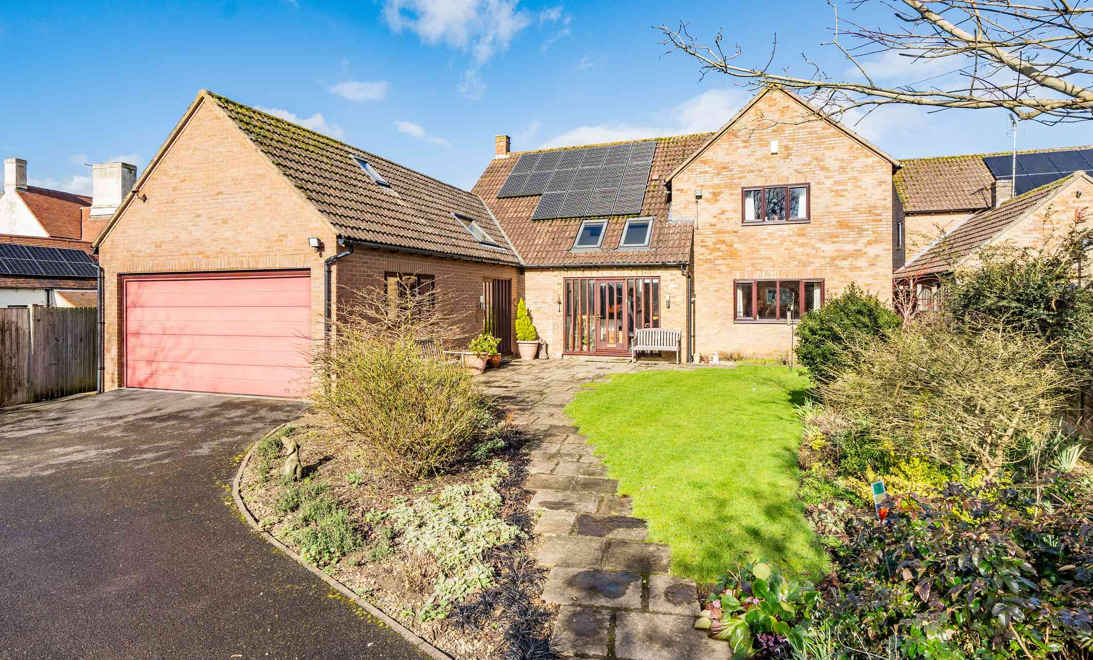
The End House, Glebe Close, Frampton on Severn, Gloucester, GL2 7EL Guide Price £850,000