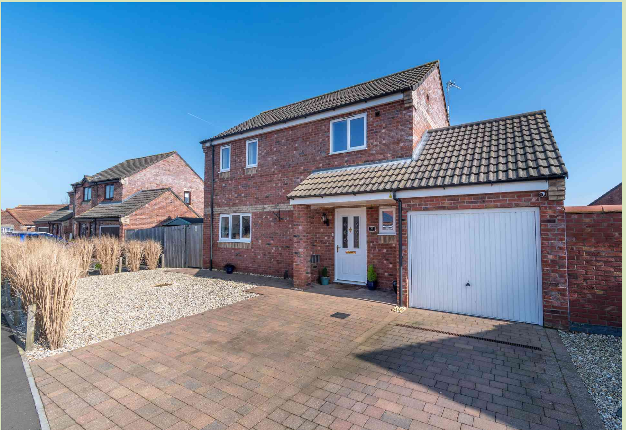
31 Salmons Way, Fakenham Guide Price £325,000