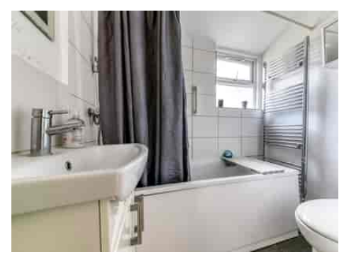
Luna Road, Thornton Heath, Surrey, CR7 8NY