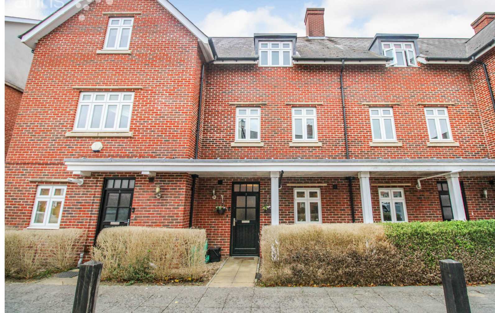
Gabriels Square, Lower Earley, Reading, Berkshire. RG6 3WN.