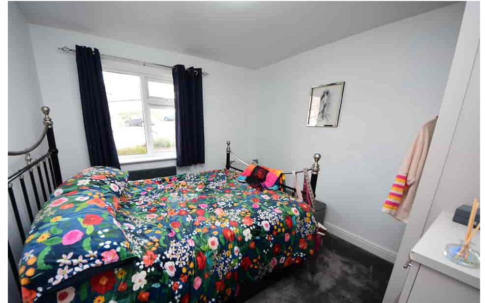
17 Winston Close, Woodford Halse, Daventry, Northamptonshire. NN11 3NT Guide Price £107,500 - Leasehold