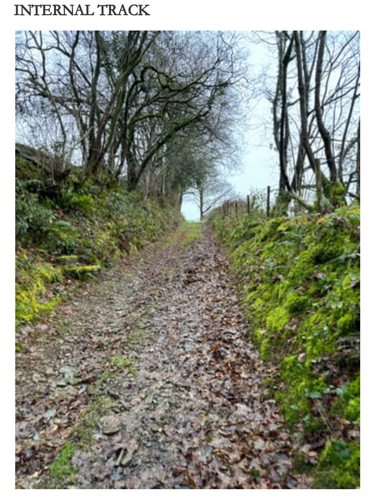
VIEWS TO SOUTH