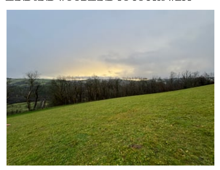
LAND TO NORTH WEST