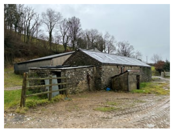
Buzzards View barn comprises a stone and slate barn 50' x 18' approx which is divided internally as 5 stable boxes. This has a further stone built lean-to with corrugated roof.