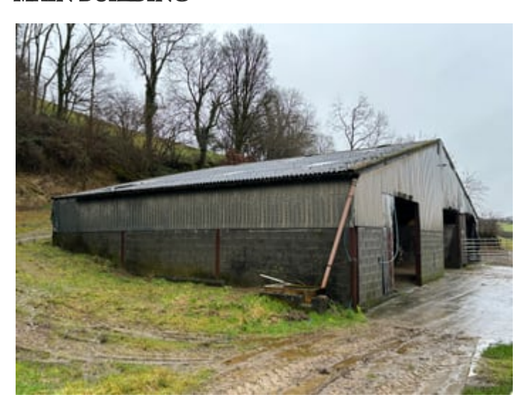
The main general purpose building is central to the yard and comprises a steel portal framed shed (45' x 30') + 2 side lean-to's (45'x 20' and 45' x 20' each).

The building is of concrete shuttered and block walls with clad roof and sides. There is a further extensive timber lean-to workshop which is corrugated clad, suitable for a variety of purposes.