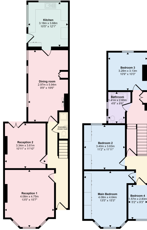
Ground Floor Approx 73 sq m / 789 sq ft

Approx Gross Internal Area 136 sq m / 1459 sq ft