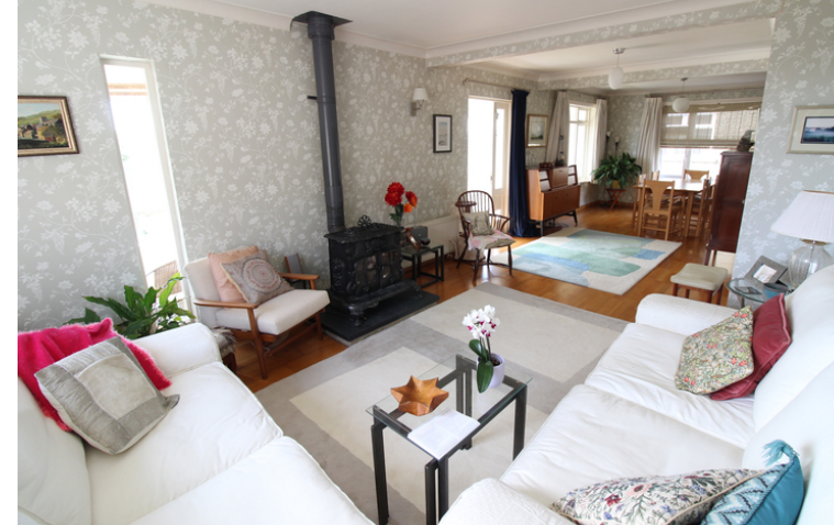
Lorien, Bank Top Drive, Riddlesden, Keighley, West Yorkshire, BD20 5PX