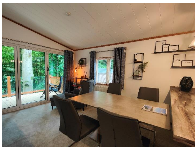
OPEN PLAN LIVING/DINING AREA

KITCHEN (12' x 10'5) Fitted kitchen with built-in oven and microwave, hob with extractor hood above, integrated fridge freezer, wine cooler, washing machine and dishwasher. Breakfast bar, UPVC double glazed window to the side and radiator.