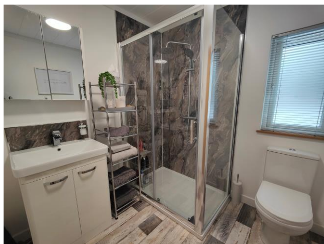
EN-SUITE TO MASTER

EN-SUITE SHOWER ROOM Shower cubicle, WC and wash hand basin with storage below. Wall cabinet, heated towel rail and UPVC double glazed window to the side.