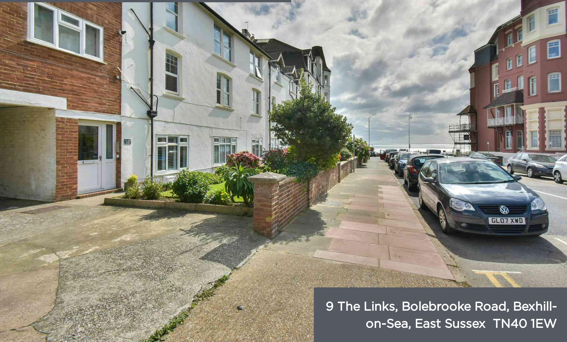
9 The Links, Bolebrooke Road, Bexhill- on-Sea, East Sussex TN40 1EW