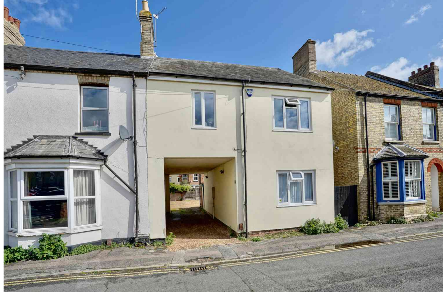
Ingram Street, Huntingdon PE29 3QQ