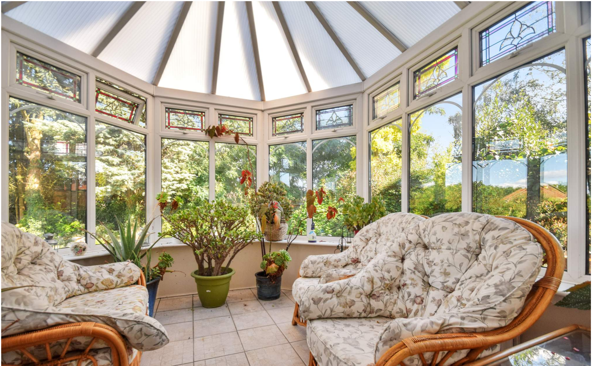
THE PLATTERS, RAINHAM, GILLINGHAM, KENT, ME8 0DJ