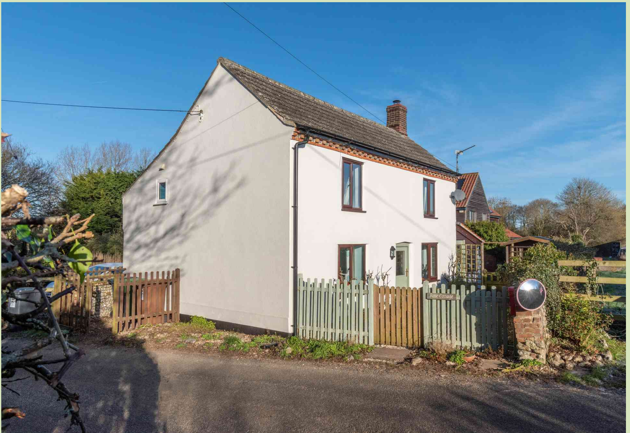
Rose Cottage, Stibbard Guide Price £350,000