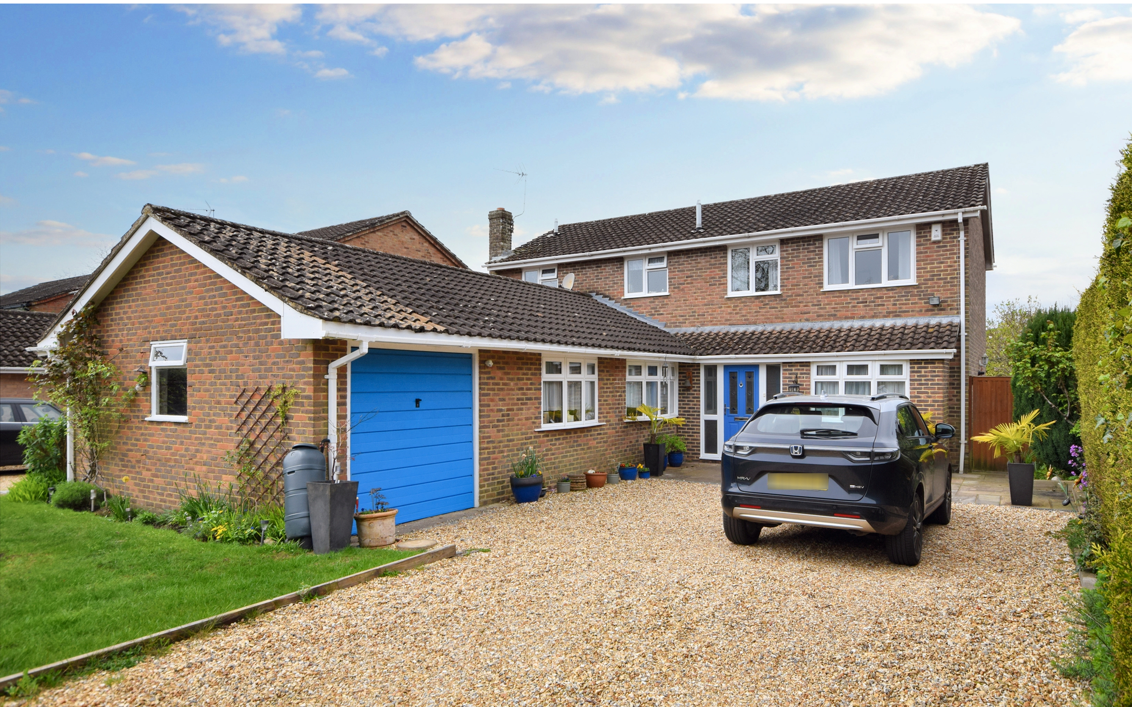
4 The Boreen, Headley Down, Near Grayshott, Hampshire. GU35 8JY. Guide Price £750,000