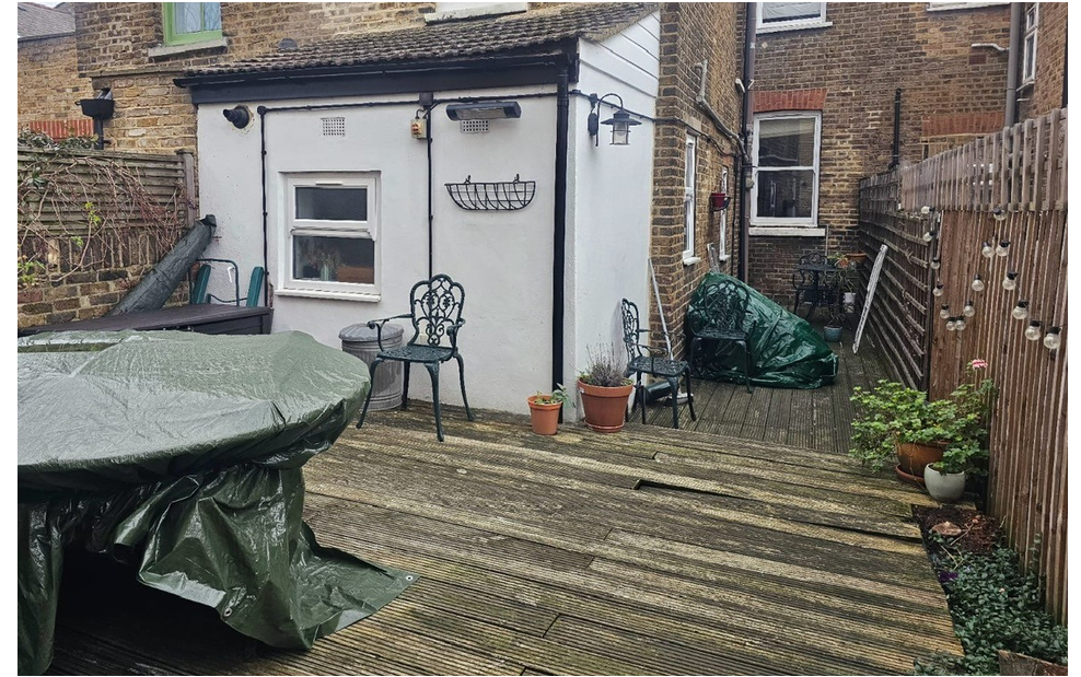
College Road, Kensal Rise, London NW10 5EL £2,150 pcm