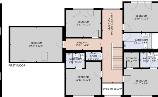
GROSS INTERNAL AREA TOTAL: 3,421 sq ft GROUND FLOOR: 1,192 sq ft, FIRST FLOOR: 1,340 sq ft, SECOND FLOOR: 889 sq ft EXCLUDED AREAS: GARAGE: 422 sq ft SIZE AND DIMENSIONS ARE APPROXIMATE, ACTUAL MAY VARY