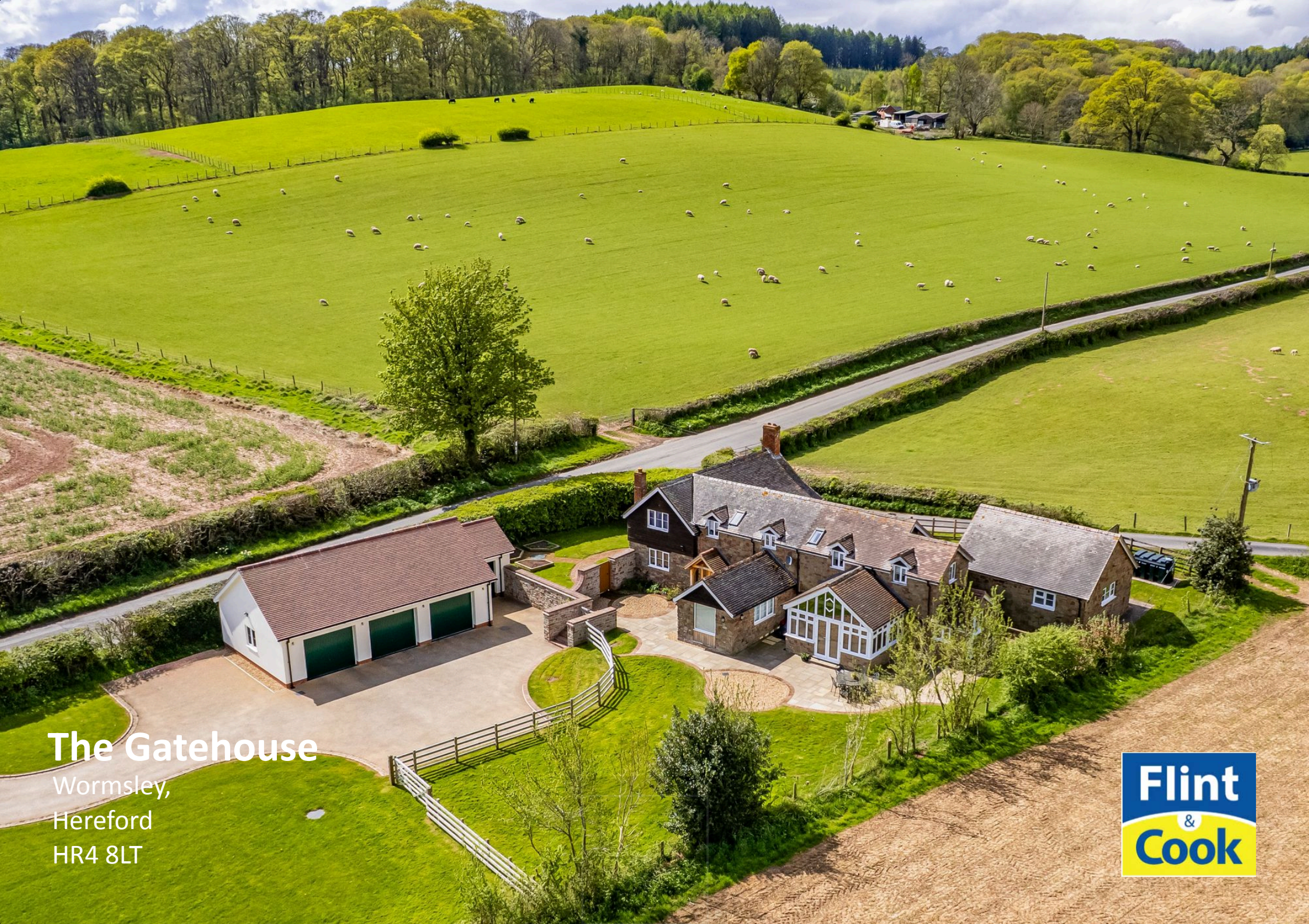
The Gatehouse Wormsley, Hereford HR4 8LT