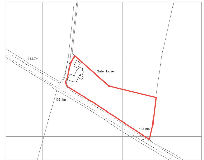
Plan not to scale for illustration purpose only