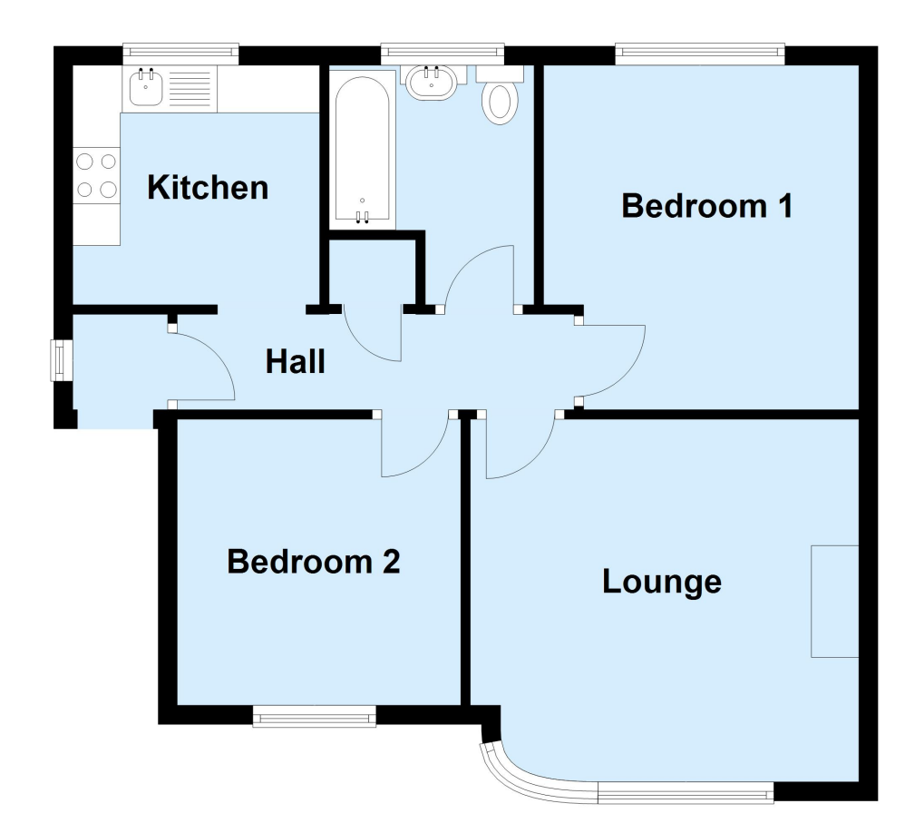
This plan is for general layout guidance and may not be to scale. Plan produced using PlanUp.

Disclaimer: All Measurements are approximate. No equipment, circuits or fittings have been tested. These particulars are made without responsibility on the part of the Agents or Vendor their accuracy is not guaranteed nor do they form part of any contract and no warranty is given.