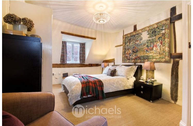
18' 8" x 10' 9" (5.69m x 3.28m)