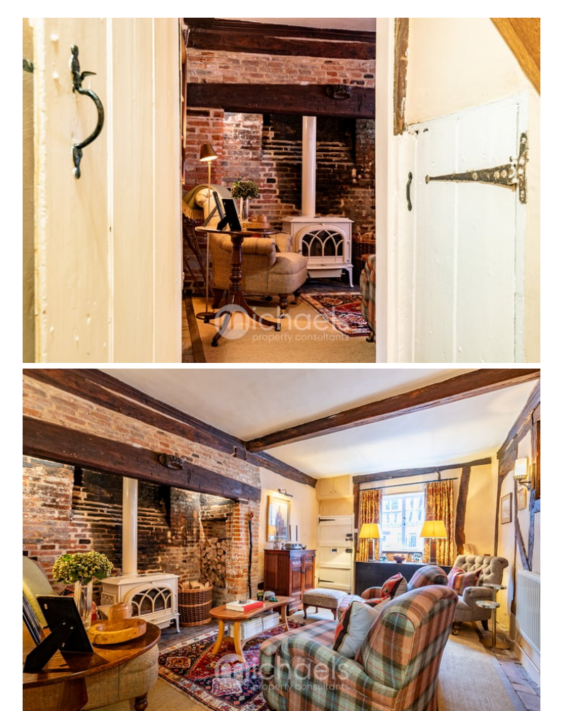
18' 2" x 10' 9" (5.54m x 3.28m)