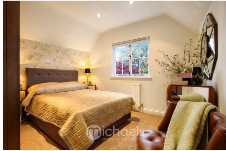
12' 7" x 10' 10" (3.84m x 3.30m)