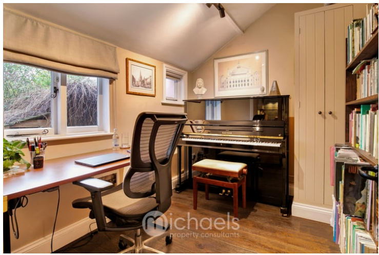
9' 0" x 7' 9" (2.74m x 2.36m)