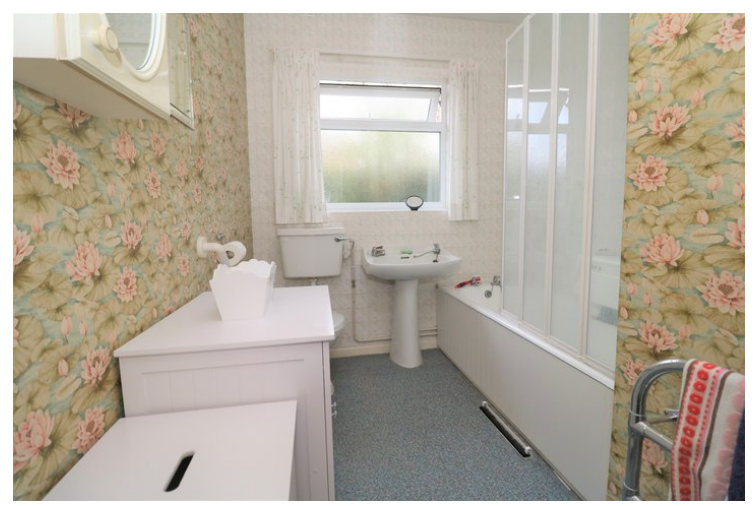
Window to side, radiator, W/C, single panelled bath with over head shower.