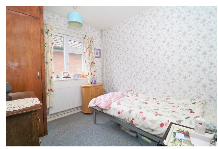
8^{\circ} 2" x 9° 5" (2.49m x 2.87m) Window to side, radiator, built in storage cupboard.