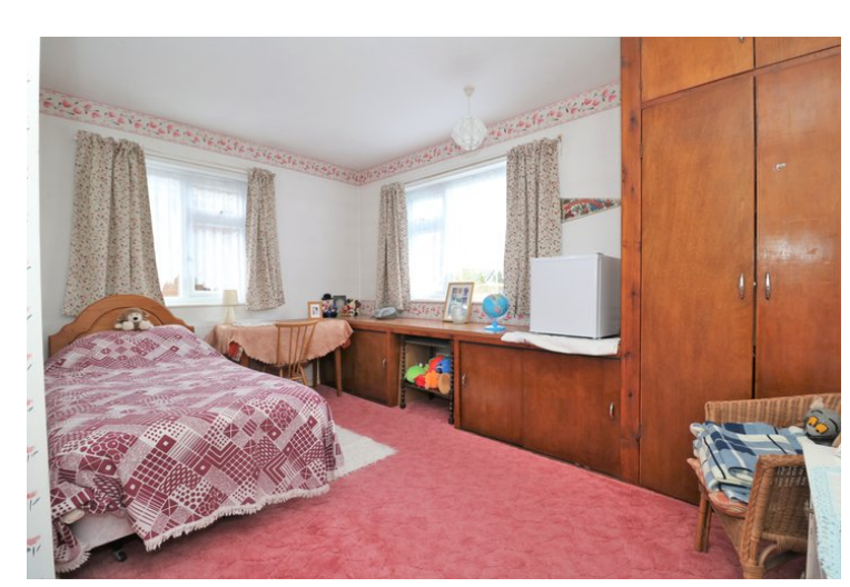
13' 11" x 9' 0" (4.24m x 2.74m) Window to front, radiator, fixed built in storage.