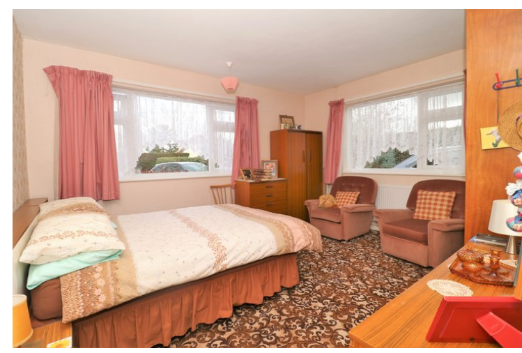
13'11" x 11'9" (4.24m x 3.58m) Window to front, radiator, access to built in wardrobe.