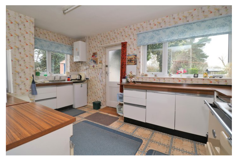
14' 11" x 9' 4" (4.55m x 2.84m) Windows and door to rear, range of eye and low level fitted cupboards with work surface over, inset stainless steel sink, space for free standing fridge/freezer, washing machine, free standing Aga to remain (STN) acces to larder, storage cupboard.