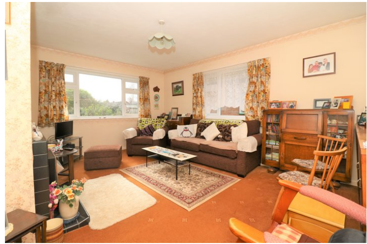
17' 6" x 12' 11" (5.33m x 3.94m) Windows to rear, radiator, electric fire place.