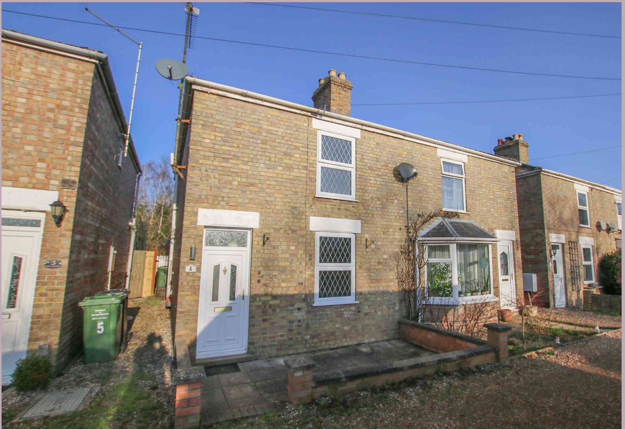
4 Moat Terrace, Walpole St Peter £875 per calendar month