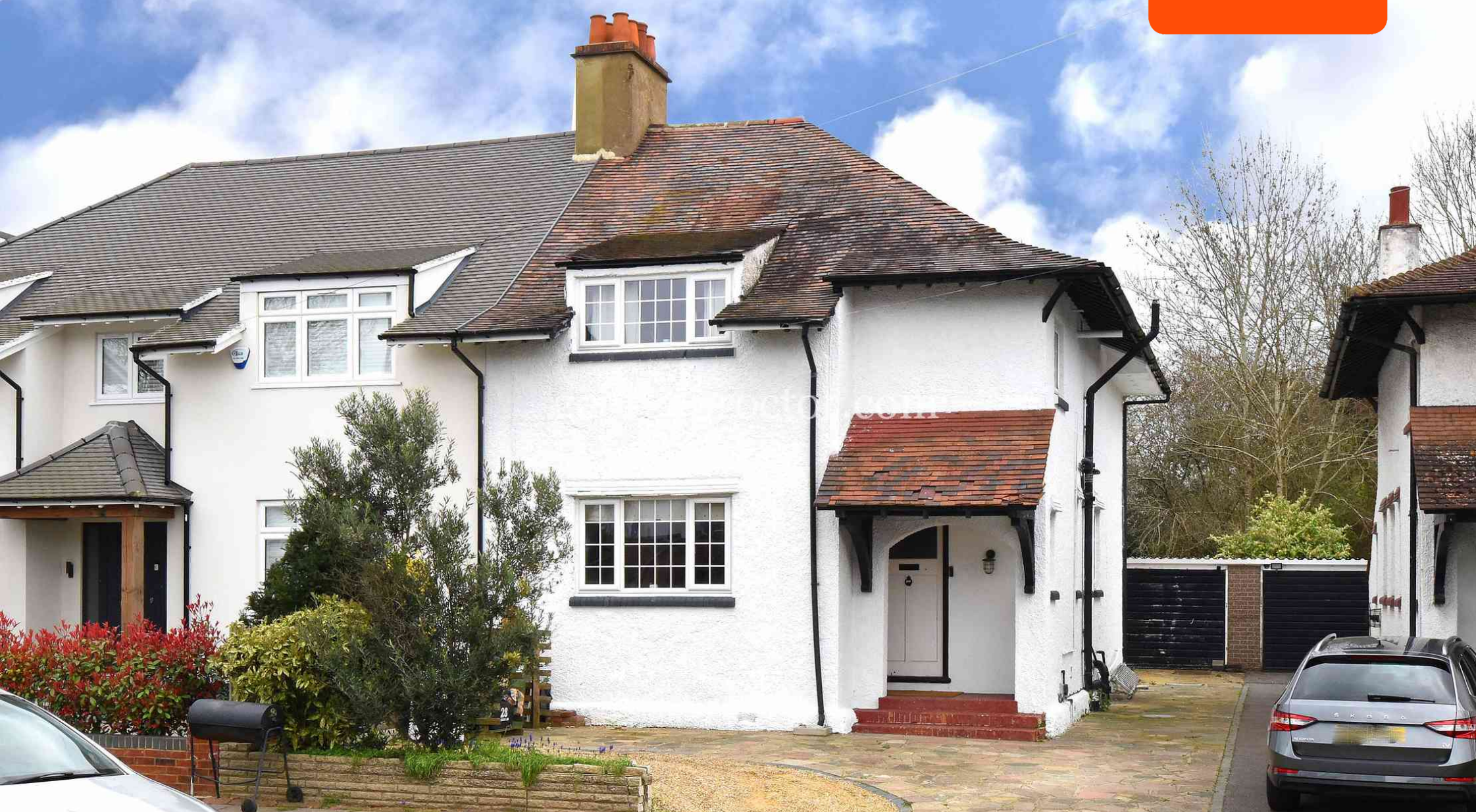
Blackbrook Lane, Bromley, Kent. BR2 8AY