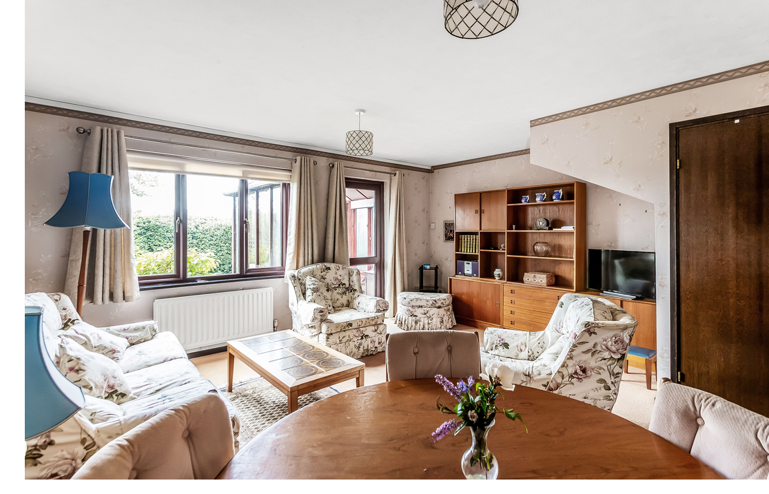
12 Padbrook, Oxted, Surrey RH8 0DW £525,000 - Freehold