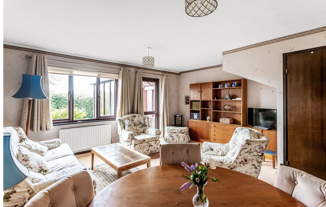
12 Padbrook, Oxted, Surrey RH8 0DW £525,000 - Freehold