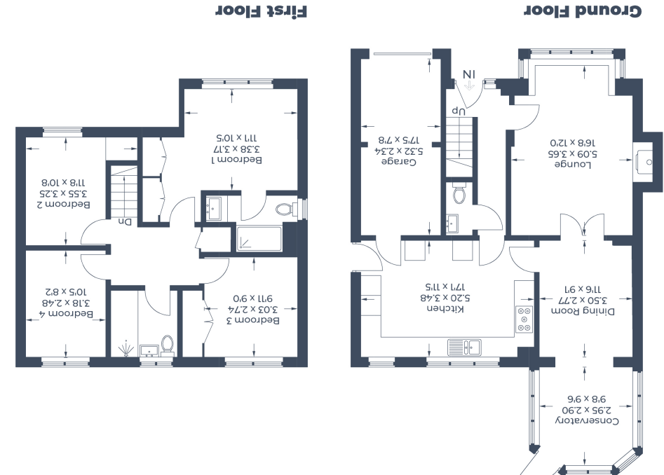
Illustration for identification purposes only, measurements are approximate, not to scale. © CJ Property Marketing Produced for Peter & Lane First Floor