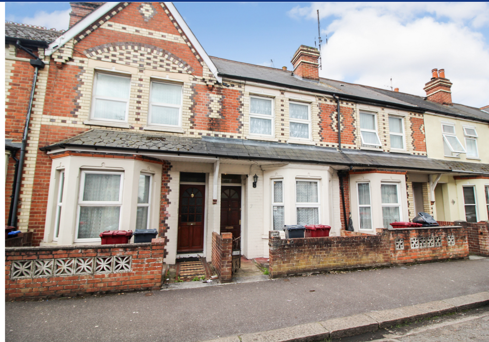
Catherine Street, Reading, Berkshire.