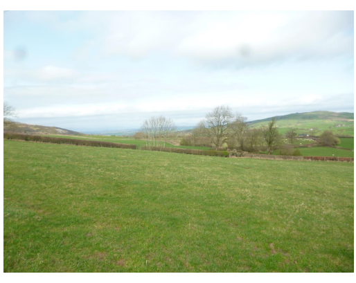
Lot 2 comprises a 2.55 acre plot which is accessed directly from the village road. The meadow or pastureland is in excellent heart and benefits from the mains water trough which is situated in the boundary between Lot 1 and 2 and is used by both Lots