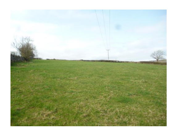
LOT 2 (Marked Blue on the Plan)