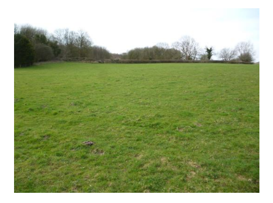
LOT 1 (Marked Red on the Plan)